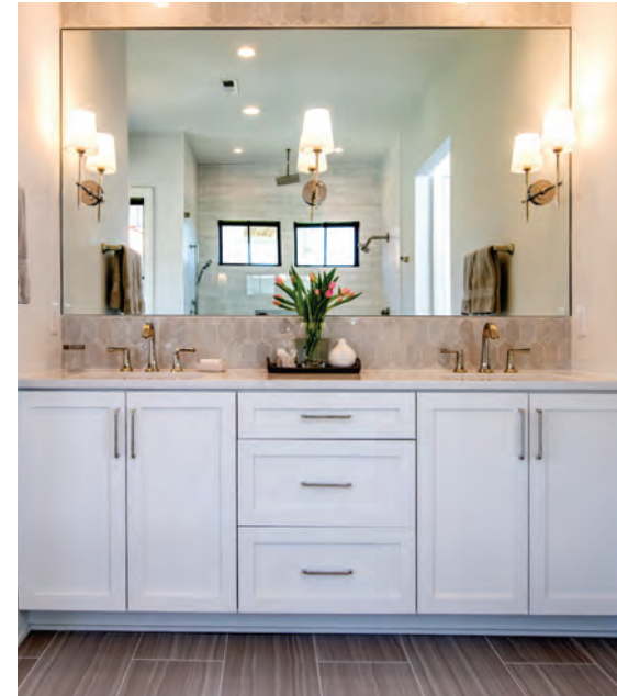
(clockwise from above) Warmer textures and different woods combine to create a functional, welcoming space; The home features a modern twist on coastal and farmhouse styles; Bell Custom Homes helped select finishing touches to create a coastal, neutral palette.

When Patterson and Heather explain the vision, the intention of each detailed decision becomes evident, while still blending effortlessly. The finishes and selections create the splendid modern