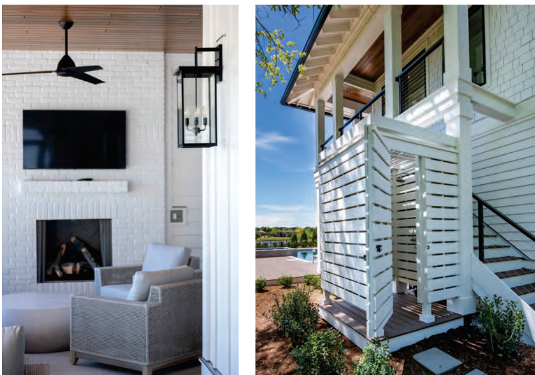
(left) Bell Custom Homes, Ocean 3 Design and Hooper and Patterson Interior Designs collaborated on the overall design elements. (right) A built-in outdoor shower complements the pool.

And with views of Landfall Lake and the Intracoastal Waterway, who can blame them? Together they worked with Bell Custom Homes, Ocean 3 Design and Hooper Patterson Interior Designs to capitalize on the sights around them and to create the perfect space for their family of four.